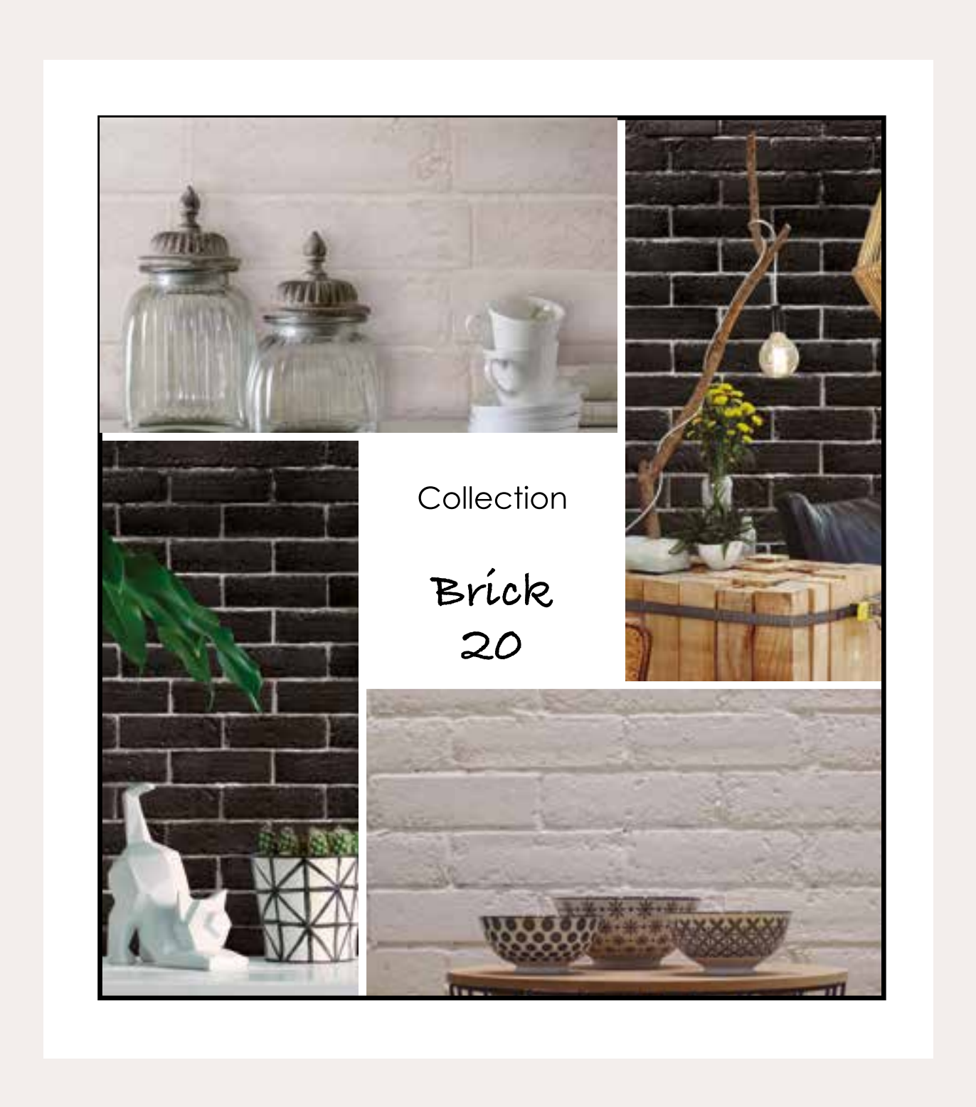
REVESTIMIENTO / WHITE BODY GLAZED WALL TILE / FAÏENCE